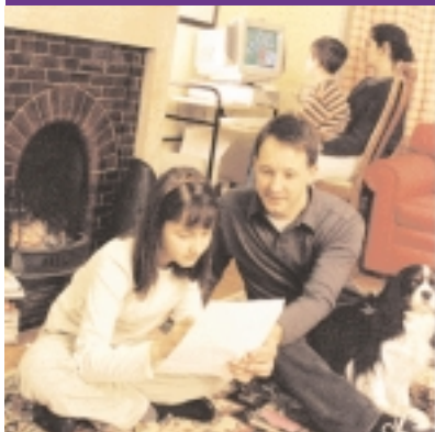
Strong and safe communities