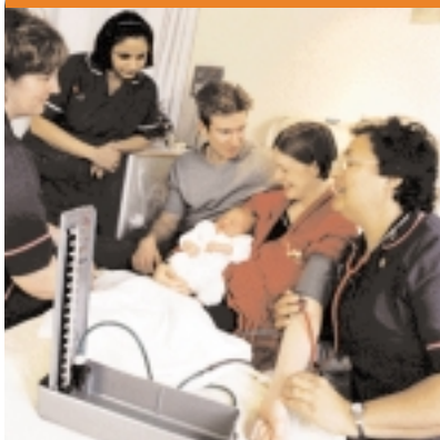
A modern welfare state