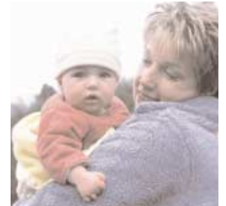
Investing in the future...new babies to get our Child Trust Fund

Our active welfare state has so far been based on work, finance and services. It is now time to