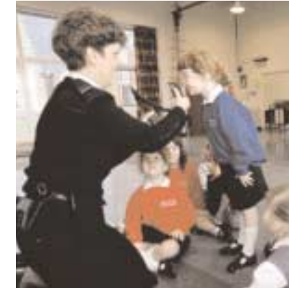
Primary school children learn about safety

Our rules of evidence fail to trust the good sense of judges and jurors. Recent case law has extended the admissibility of evidence of previous conduct. If there is any remaining doubt, we will consider legislation to reinforce the judgement. Pending the findings of the Auld report, we see a strong case for a new presumption that would allow evidence of previous convictions where relevant. Currently only the prosecution must disclose all expert evidence and names of all witnesses. In the light of the Auld report, we will consider whether the defence should do so too. In addition, witnesses should be able to refer to their