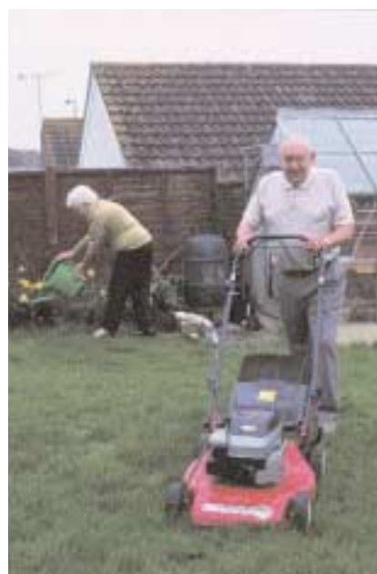
Security in retirement... state pensions to rise with Labour

Our first priority was to help those on lowest incomes: we have lifted the incomes of the 1.7 million poorest pensioners by at least £800 a year, and for some couples by up to £1,400. Pensioner households are on average £11 per