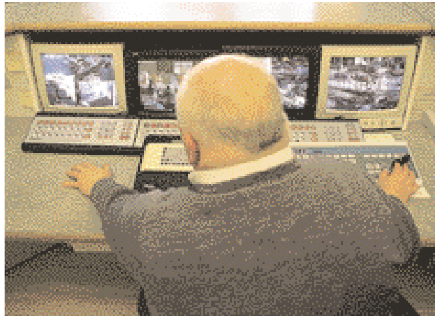
Surveillance strategy...extra crime-fighting investment is targeting community crime

Labour will ensure more people see more police in the community. We will discuss with the police how those on the frontline might be rewarded for their skills, experience and