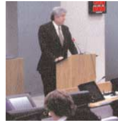
Devolution delivered... Rhodri Morgan at the National Assembly

financial allocations to all devolved bodies. English MPs make up 85 per cent of the UK Parliament, so there is no case for threatening the unity of the UK with an English Parliament, or the denial of voting rights to Scottish, Welsh and Northern Ireland's MPs at Westminster.