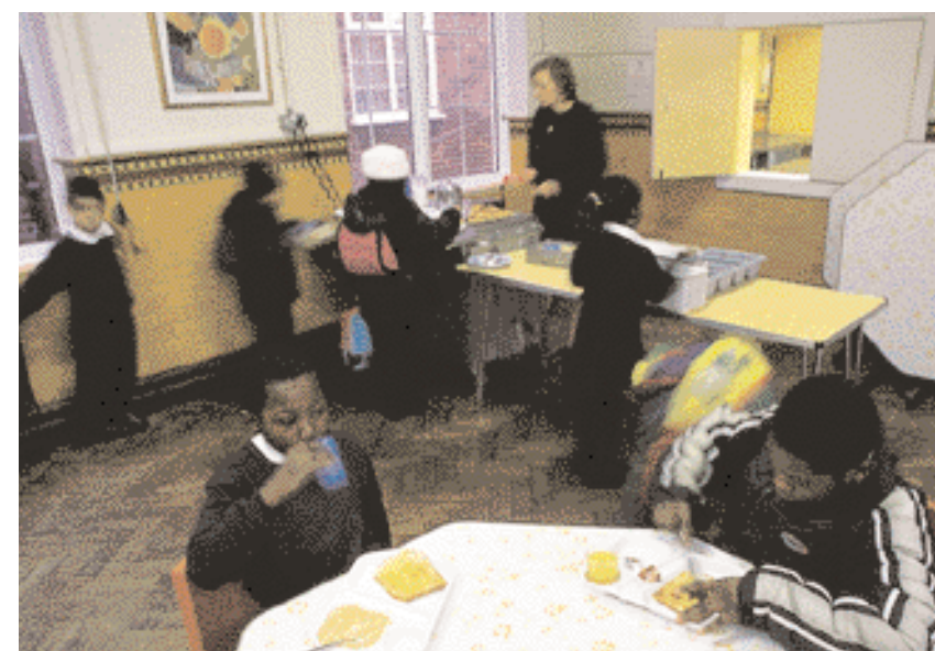
One million children lifted out of poverty