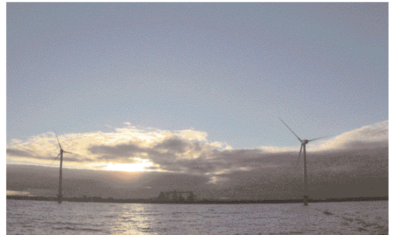
Natural resources... Labour is committed to a healthy environment and renewable energy, taxing pollution and rewarding clean production