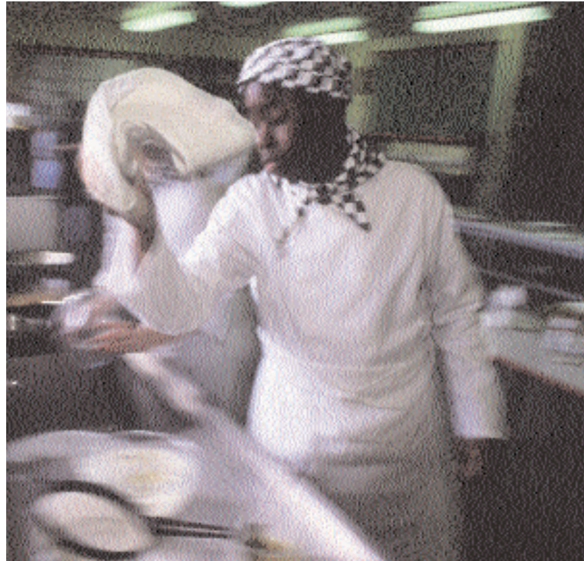
Skills for life... a young catering student works towards a vocational qualification

safe and reliable childcare nationwide, allowing all parents to combine home and work confident in the childcare they have chosen. We will help with the costs of childcare, through the Childcare Tax Credit, and will look to extend it to people looking after children with disabilities and to shift-workers. We will support the commitment of community and voluntary groups to build up a diverse range of childcare – including neighbourhood nurseries and informal care (see 'World-class public services').