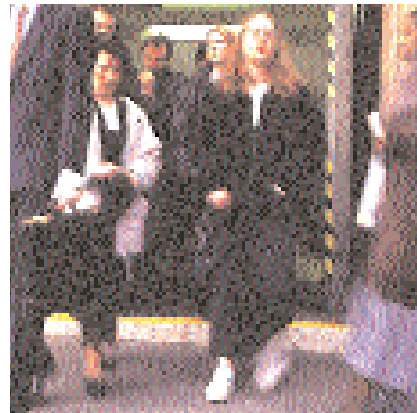
Britain is leading economic reform in Europe

We have seen the alternative. By 1997 Britain had retreated into itself: business was global, people travelled and worked around the world, our culture was open to new ideas, yet our