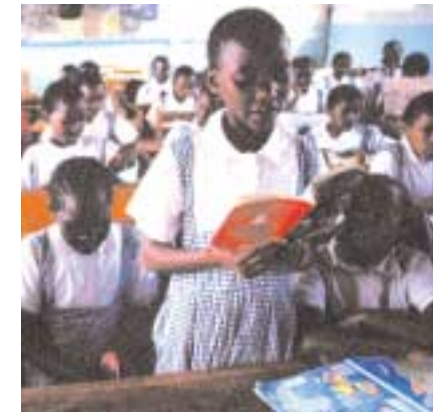
International aid... education has a special place for Labour

working for international agreement on climate change, improved integration of the environment in European policies and a strong