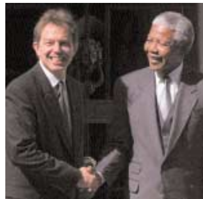
Promoting human rights... Tony Blair with Nelson Mandela

This is morally right, but also in our interest. Many of the world's biggest challenges – from violent conflict to rapid population growth to environmental threat – are caused or