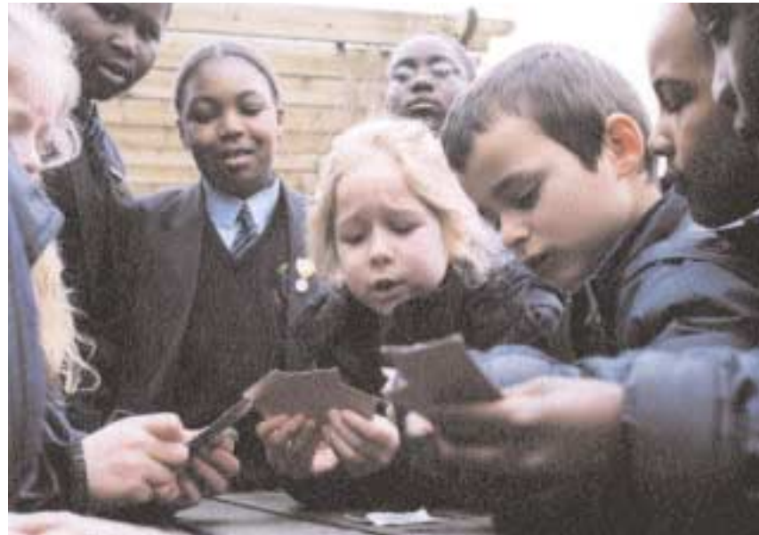
Multicultural Britain... an inclusive society begins at school

Labour's ambition is a partnership of mutual