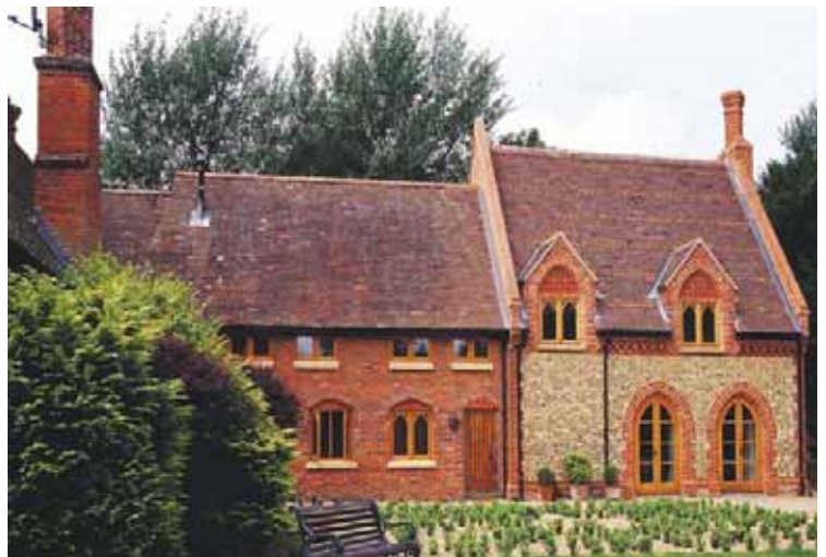
FMB Master Builder of the Year Awards Winner

I am a property developer, and every day of my life I see the building industry at work. I see the potential of great buildings to uplift people's lives and I see the misery that poor quality construction can cause. I hope that you will read this Manifesto and be encouraged to focus on construction, act on its message and Build the Future.