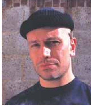
...a cowboy builder