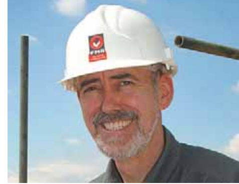
...or a reliable professional